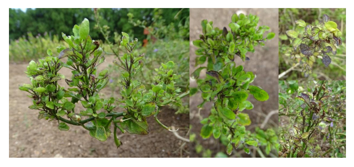
Fig. 1: Pale green in veinal and interveinal region with pinkish patches on leaf lamina