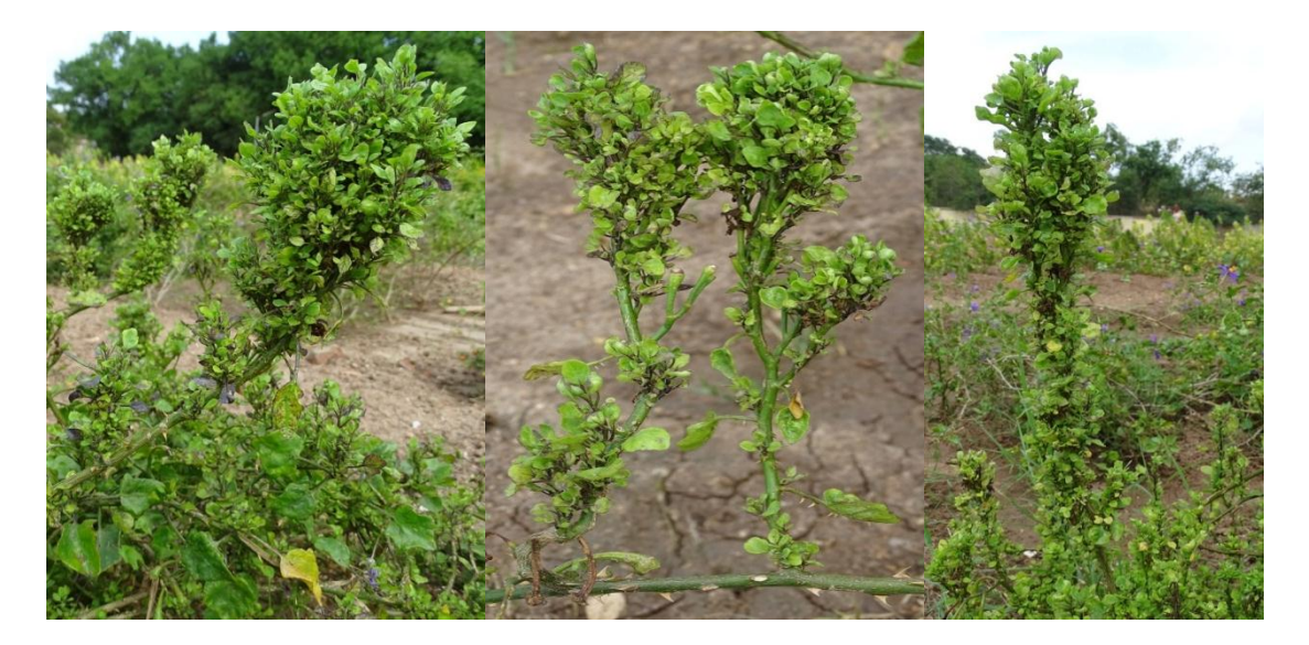
Fig. 2: Phyllody symptom